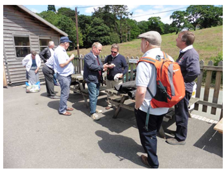
The gang chew the cud while waiting for the train

The first train to pull out was hauled by Class 14/9 14901 (more about this later) so the populous opted to wait for the steam engine (or the 'chuffer' for those old enough) and it turned out to be the Polish one. We alighted at Froghall Station and waited for the engine to run round. It stopped to take on water at the chute and the fireman must have been day-dreaming as it filled to overflowing for a good five minutes so we had to wait for the deluge of surplus water to drain away on the tracks. To our surprise we found out that we would be hauled back by the Class 14/9 diesel. It trundled back through Cheddleton Station and then through the 532 yard tunnel. It was completely pitch black through the tunnel as the lights were not functioning which prompted Mike to do afterwards the rounds to enquire, "He haw, he haw, he haw. Has