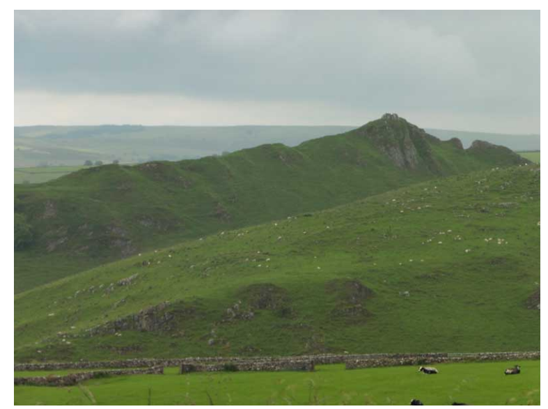
The scenery on route to Cheddleton

With all the combined intelligence of the assembled petrol-heads, we were convinced that we could get it running again. We inspected the engine first and deduced that it couldn't possibly have broken down as was a Rolls Royce, and it is common knowledge that they never break down, they simply temporarily cease to proceed. We tried jump starting it and spraying the carb with Easy-Start, but all to no avail. The driver must take most of the blame as he allowed it to break down on a flat section of line so we couldn't all push it, and bump start it in second gear. If only he had parked on a hill! Deryck had, by this time, all the groups' sympathy, with nobody apportioning any blame upon him whatsoever, even though an hour had passed without any progress and tempers were becoming frayed as there was not a pub in sight and valuable drinking time was being eroded. It was then a case of Miss Sophie to the rescue. Relief engine Class 33 33102 'Sophie' was summoned and she duly arrived to save the day. The defunct diesel was uncoupled and Sophie dragged it to the front of the train to coupled up to the carriages. We were then finally pulled back 'double-headed' into Cheddleton.