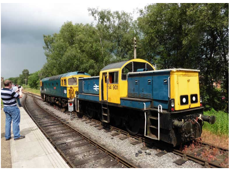
Miss Sophie to the rescue - uncoupled and heading for home

With all the combined intelligence of the assembled petrol-heads, we were convinced that we could get it running again. We inspected the engine first and deduced that it couldn't possibly have broken down as was a Rolls Royce, and it is common knowledge that they never break down, they simply temporarily cease to proceed. We tried jump starting it and spraying the carb with Easy-Start, but all to no avail. The driver must take most of the blame as he allowed it to break down on a flat section of line so we couldn't all push it, and bump start it in second gear. If only he had parked on a hill! Deryck had, by this time, all the groups' sympathy, with nobody apportioning any blame upon him whatsoever, even though an hour had passed without any progress and tempers were becoming frayed as there was not a pub in sight and valuable drinking time was being eroded. It was then a case of Miss Sophie to the rescue. Relief engine Class 33 33102 'Sophie' was summoned and she duly arrived to save the day. The defunct diesel was uncoupled and Sophie dragged it to the front of the train to coupled up to the carriages. We were then finally pulled back 'double-headed' into Cheddleton.