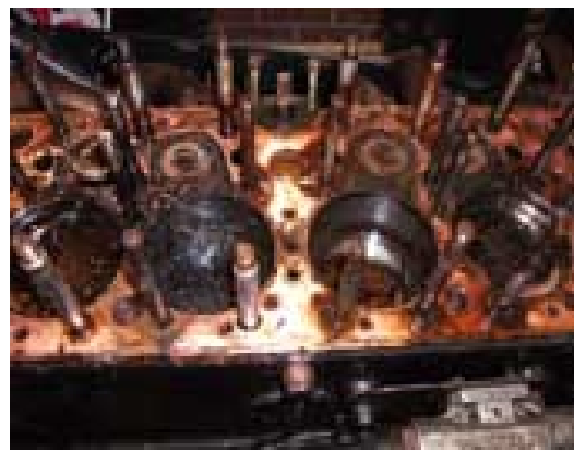
Getting ready for lift off

I had been desperately hoping that my diagnosis of a blown cylinder head would be right ( I have had some experience as I have blown three head gaskets in the past!) but I was aware that it is possible to get a similar result (loss of power and clouds of steam) from a flipping of piston rings, especially in old cars that have not been driven much, so I was very pleased to find no damage to the cylinder bores and a very distressed area of copper gasket between pots 3 and 4 along with a beautiful cocktail froth of oil and water. Indeed when I drained the sump there was half an inch of water below the eight inches (10 litres) of oil. Unlike the majority of Mark VI with the 4 1/4 litre engine the R type has the "big bore" 4 1/2 litre also developed by Rolls Royce so being a straight six each pot is roughly the size of a pint and a half and as soon as the gasket blows they can't half suck in some fluid.